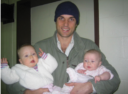
A homeless man with his children. Not the man from the Leola Homes of Hope.

Where do you go when you are a single dad with two young daughters after finding yourself homeless?